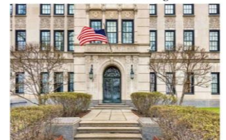
Lake Shore Estate, Chicago